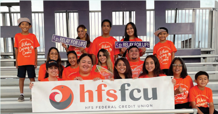
Pictured: Staff and family members of HFS Federal Credit Union.