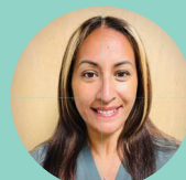
Kaliko Tangaro Chamberlain College of Nursing