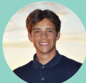
Elwin Shotts Parker School